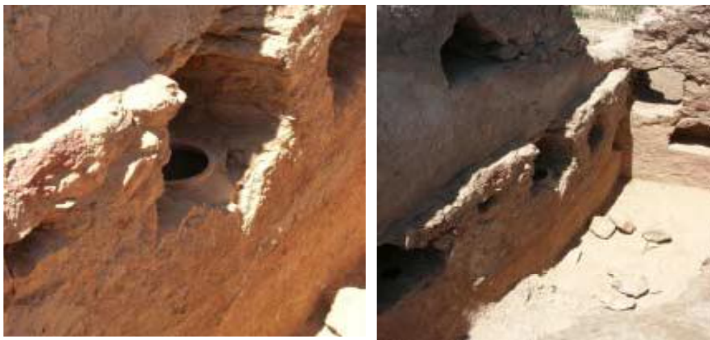
Castle mountain of Qayen

This castle of the places which are scattered among these mountains and mountain region that has overcome the plain, a narrative history, is made by Sam Ibn Nariman .7