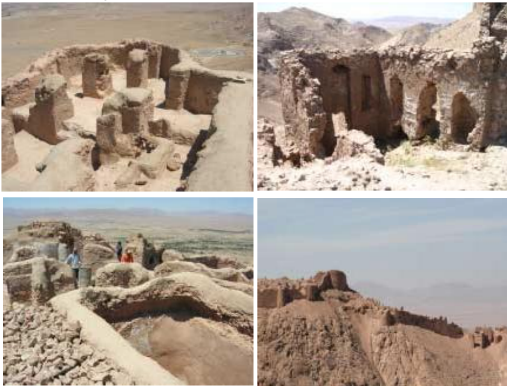
Castle mountain of Qayen

Castle mentioned longitudinal extent of more than five hundred meters in width and much less, is built on the heights, (plan comes into the castle). This area to the smaller area of several different applications have apparently has been divided. The military is uses such as settlement and warfare, residential and comfort from Castle Place, culture or location, and teaching and library, and the animals of the location such as horse riding and wagon and mule There is a floor and two floor buildings as well as visible currently available. There are several rooms with different dimensions of wood cover is fully confirmed.