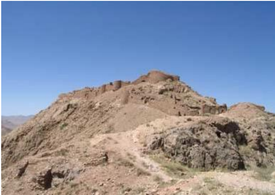
Castle mountain of Qayen

Castle Mountain Qayen can be the most important cultural centers and even the civilization of East considered significant enough role in the development of science and religion had the land. Role in the papers on Color this castle, this castle valuable indicator position in the past and the forgotten role in the present. If this work be properly introduced to visitors, especially with the exposure of the main highway south of Khorasan, for many interesting and even tourists will be controversial memory. Failed at the heart of the region castles share appropriate for attracting tourism to the area in and where we value the natural and historic , innocence washed the dust and world see the it .